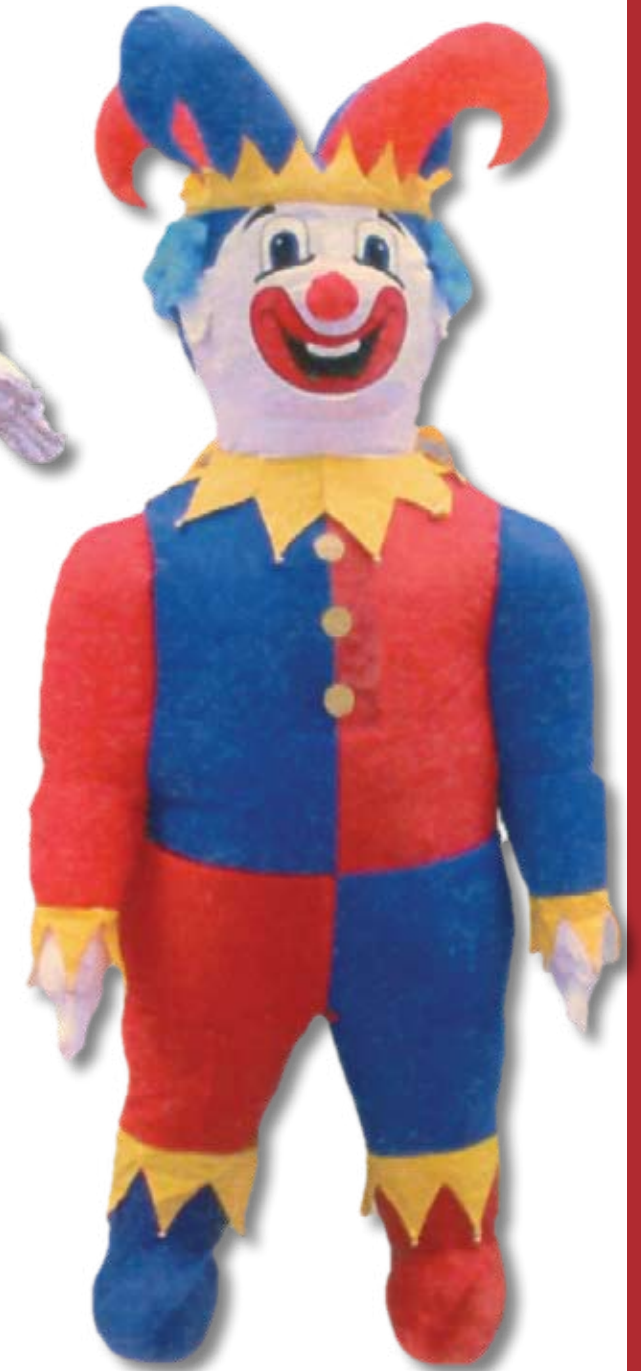
BELL HAT INFLATABLE CLOWN SUIT 8.5' H