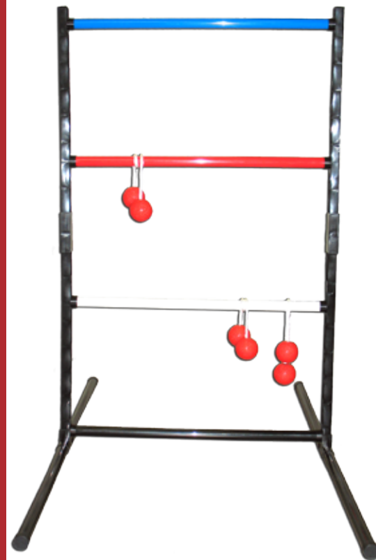
◀ LADDER BALL 16" L X 16" W Players toss the 4 "beastie" balls at the 5 holes on the board.