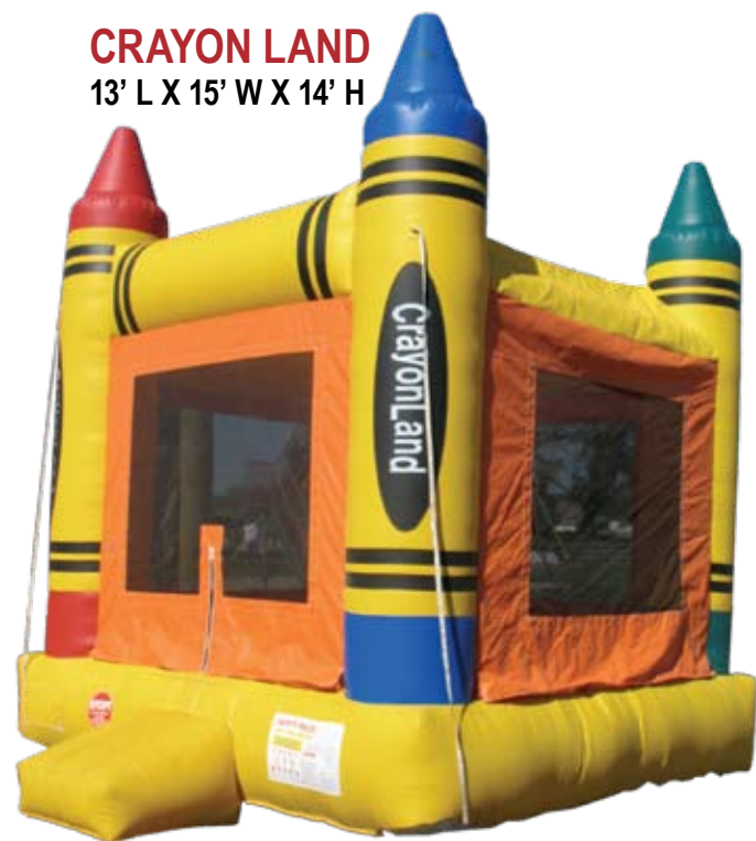
CRAYON LAND 13' L X 15' W X 14' H