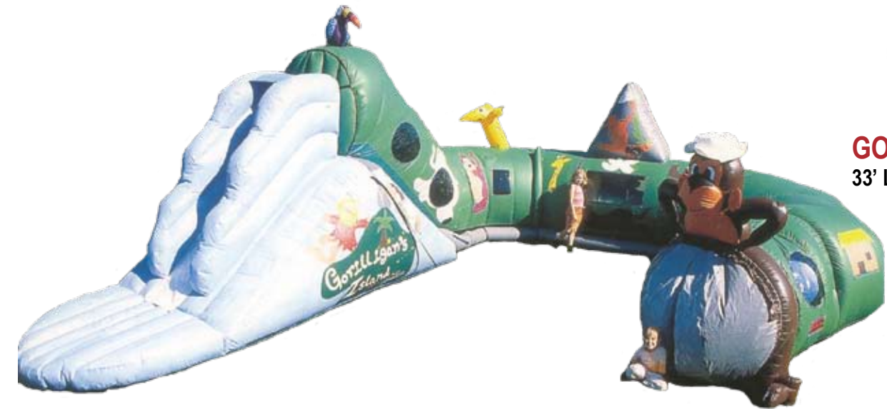
GORILLIGAN'S ISLAND 33' L X 18' W X 12' H