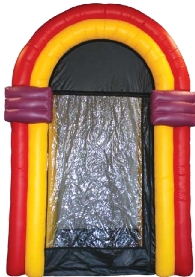
INFLATABLE MONEY MACHINE One person steps into the money machine to try to grab as much real money as possible in the time allowed.