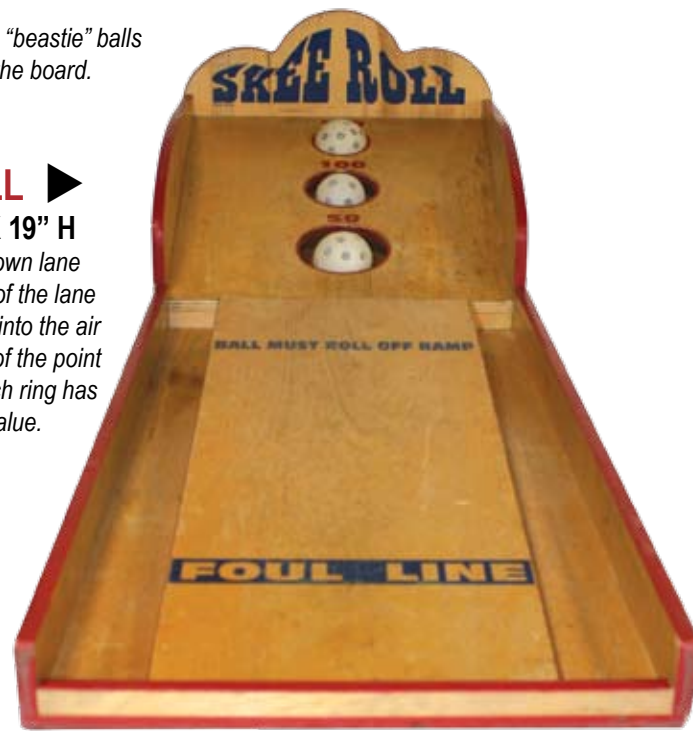
▶ SKEE ROLL 6' L X 24" W X 19" H Players roll ball down lane ramp. At the end of the lane the ball takes off into the air and lands in one of the point scoring rings. Each ring has a different point value.