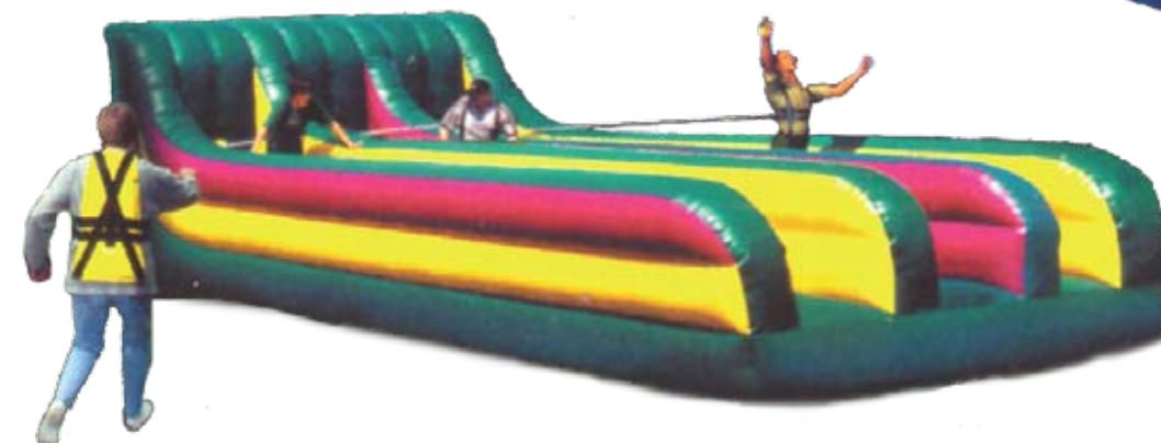
3 LANE BUNGEE RUN 35' L X 15' W X 7' H