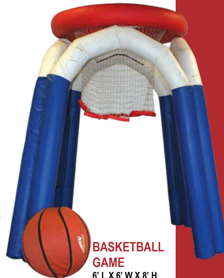
BASKETBALL GAME 6' L X 6' W X 8' H Players try to make a basket in this large hoop with an inflatable ball.