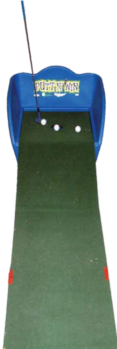
▶ PUTT N' WIN 28" L X 26.5" W X 16" H Each player putts the golf ball across and up the green, aiming for the cup at the center of the upper green. 1, 2, or 3 chances set the level of difficulty for this game.