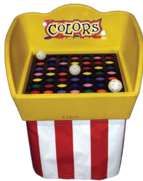
▶ COLORS 28" L X 26.5" W X 16" H On a board of 49 targets of varying colors, players must hit 3 matching colors to win the prize, or they can pick a color and try to hit it. You decide how many throws they have.