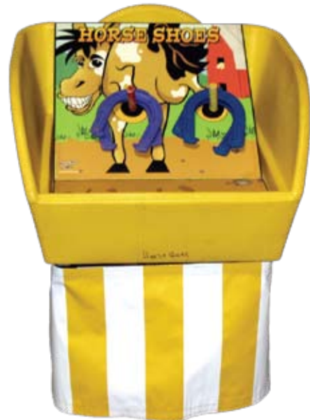
◀ HORSE SHOES 28" L X 26.5" W X 16" H Toss the shoes and try to ring the pegs.