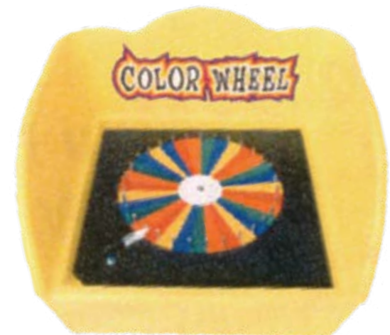
▶ COLOR WHEEL 28" L X 26.5" W X 16" H Players spin the wheel to try for the space with the winning color. You decide which one wins. Each color is on the wheel a different number of times to set the difficulty.