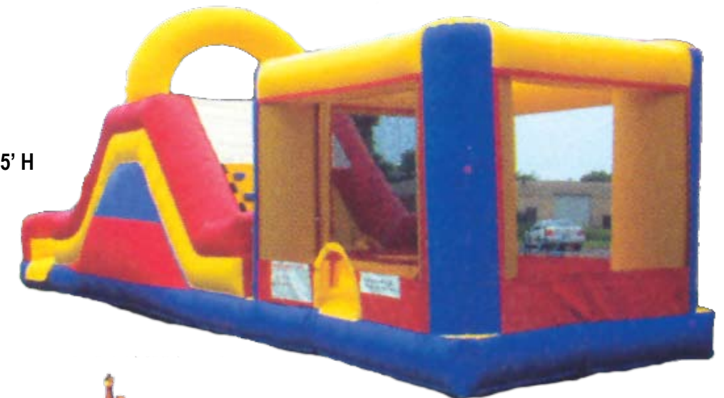
3-IN-ONE 39' L X 9' W X 15' H