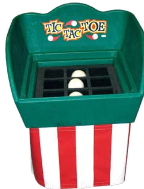
◀ TIC TAC TOE 28" L X 26.5" W X 16" H Players throw 3 balls towards the game board, aiming for one to the 9 holes. To win, the player must land all 3 balls in a row, either vertically, horizontally or diagonally.