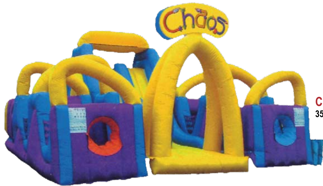
CHAOS 35' L X 25' W X 20' H