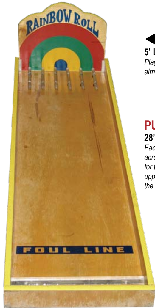
◀ RAINBOW ROLL 5' L X 17.5" W X 14" H Player rolls ball down lane aiming for the center target.