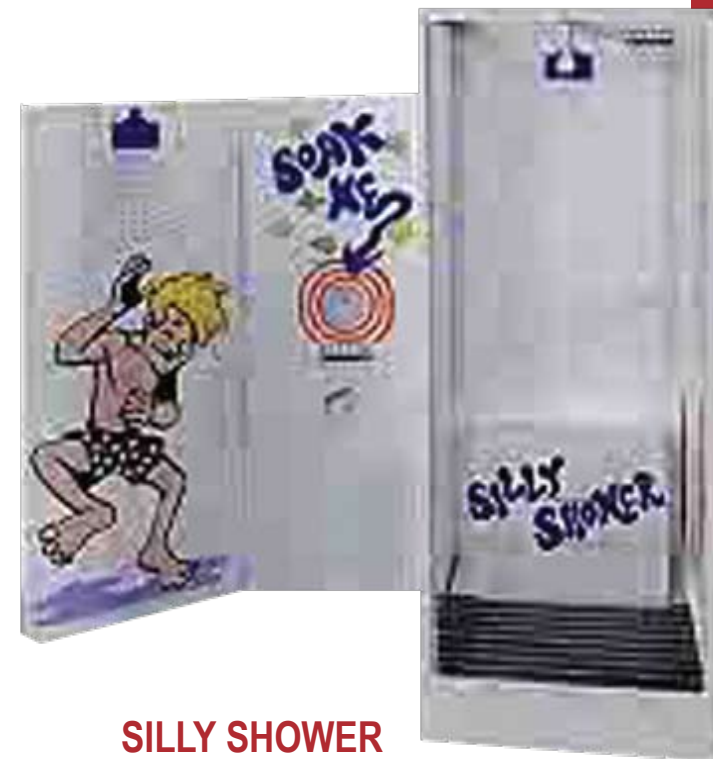
SILLY SHOWER 43' L X 32' W X 84' H (POWER OUTLET REQUIRED)