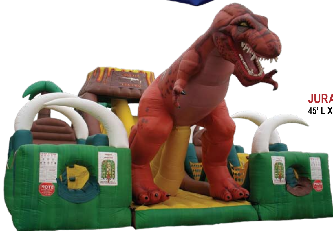
JURASSIC PARK 45' L X 25' W X 20' H