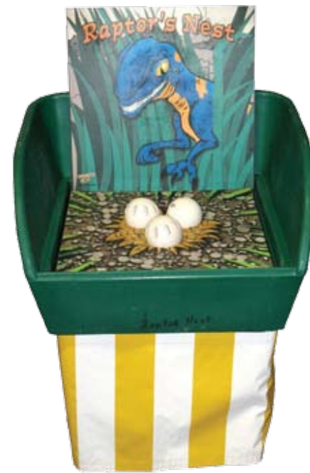
◀ RAPTOR'S NEST 28" L X 26.5" W X 16" H Toss all the balls into the RAPTOR'S NEST to win.