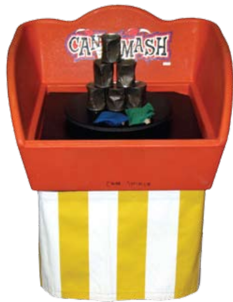
◀ CAN SMASH 28" L X 26.5" W X 16" H Players throw the beanbags to try to knock all 6 cans off the pedestal. You decide how many beanbags they get.