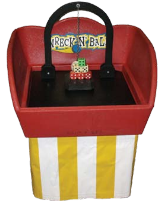
▶ WRECK N' BALL 28" L X 26.5" W X 16" H Players swing the wrecking ball and try to knock the entire building down. A classic game that can be played over and over.