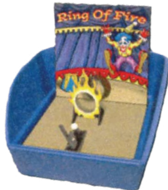
◀ RING OF FIRE 28" L X 26.5" W X 16" H Try to knock the ball through the ring of fire and into the cup.