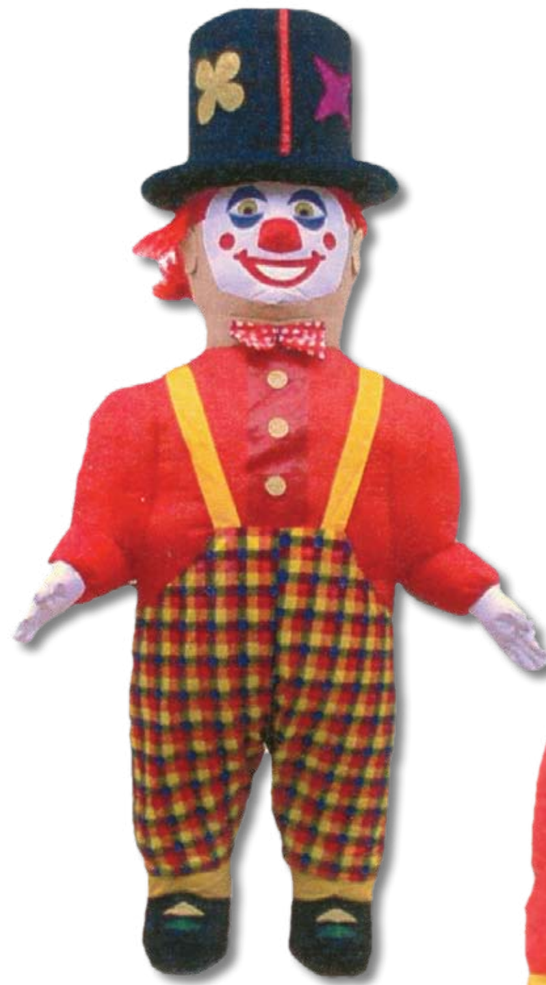
BLACK HAT INFLATABLE CLOWN SUIT 8.5' H