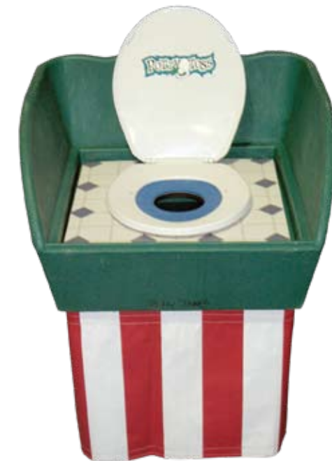
▶ POTTY TOSS 28" L X 26.5" W X 16" H Players throw three balls in this game, each aimed for the center of the potty.