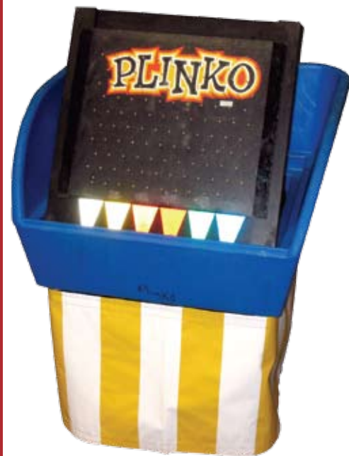
◀ PLINKO 28" L X 26.5" W X 16" H Players place a quarter at the top of the board, releasing them to slide through the pattern of pins, ending in one of six colored slots.